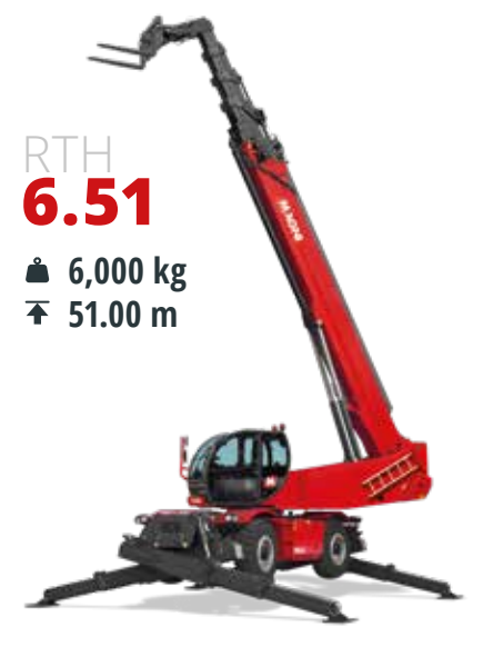
Volvo 175 kW (238 hp) @ 2,300 rpm