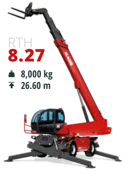
Volvo 160 kW (218 hp) @ 2,300 rpm