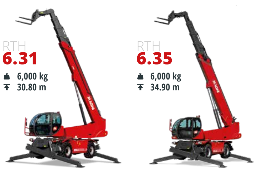
Volvo 160 kW (218 hp) @ 2.300 rpm