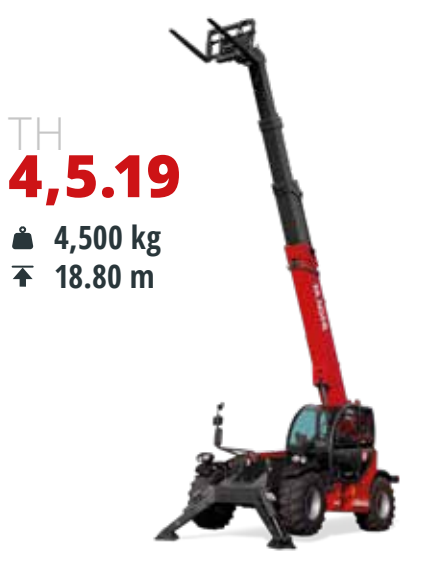
Deutz 74,4 kW (101,2 hp) @ 2,200 rpm