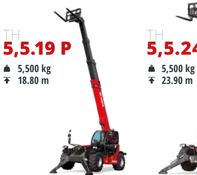
Deutz 74,4 kW (101,2 hp) @ 2,200 rpm