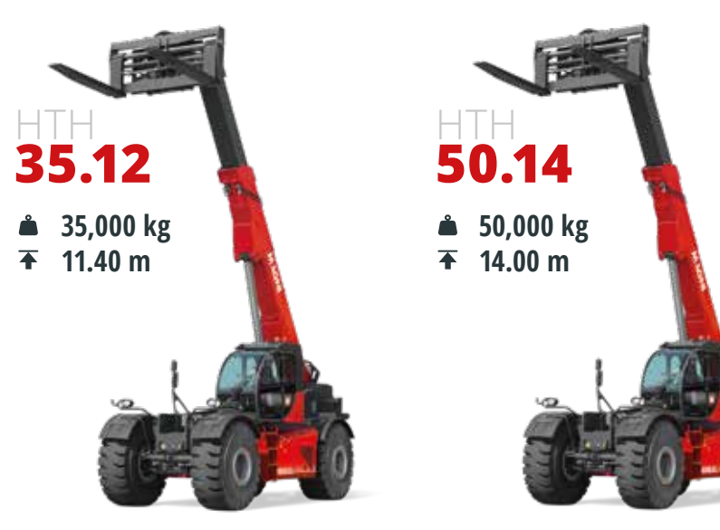
Volvo 235 kW (320 hp) @ 2,200 rpm