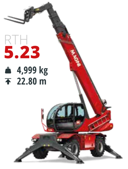
Deutz 100 kW (136 hp) @ 2,200 rpm