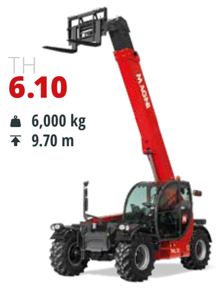
Deutz 55,4 kW (75,3 hp) @ 2,200 rpm