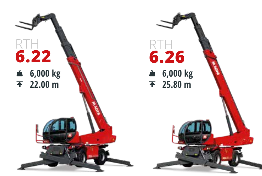
Deutz 100 kW (136 hp) @ 2,200 rpm