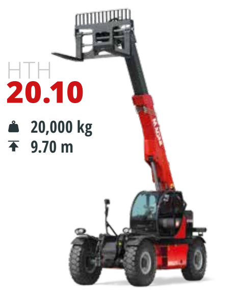
Volvo 160 kW (218 hp) @ 2,200 rpm